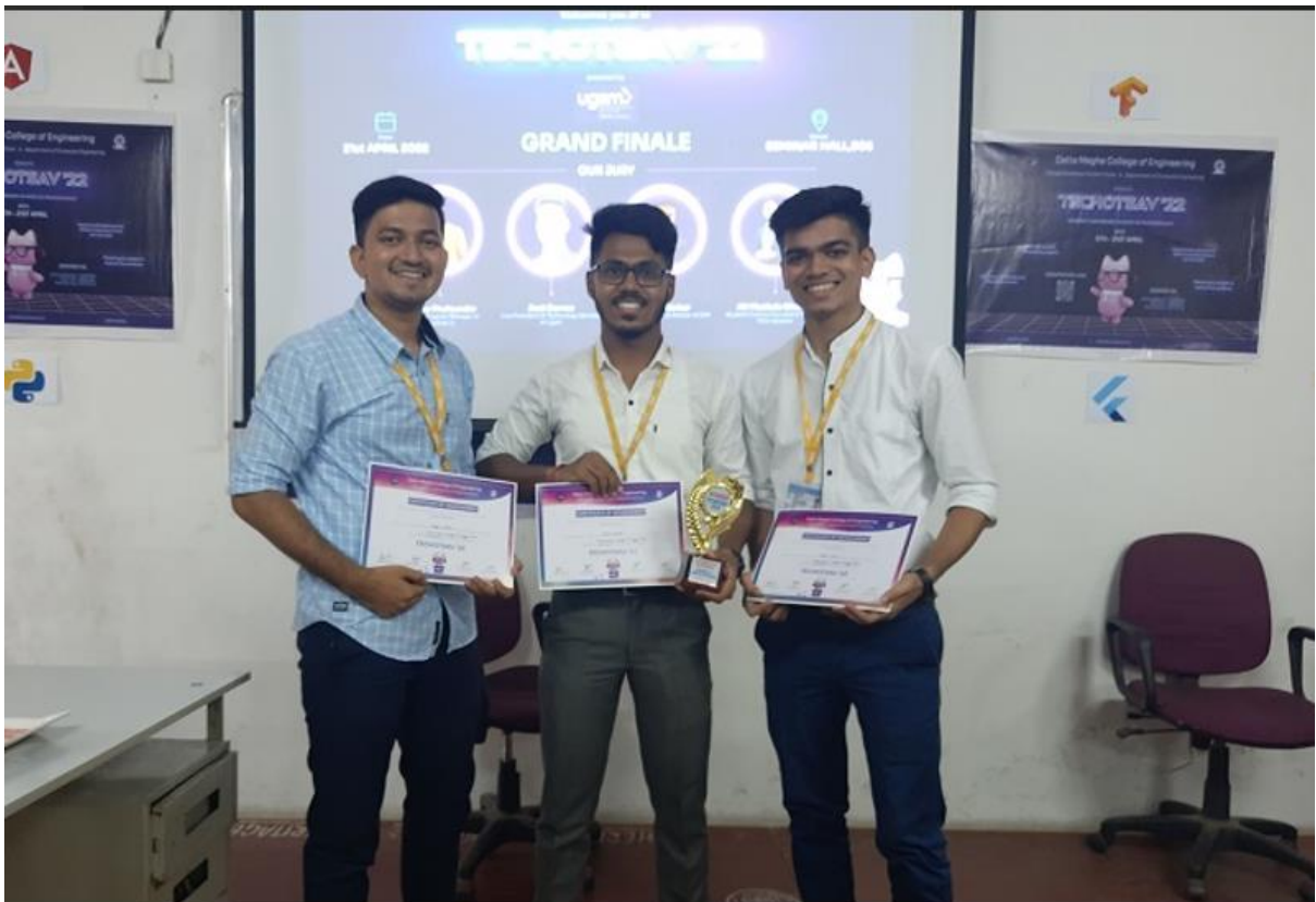
Techotrav-22 , DattaMeghe College of Engineering 2022-23