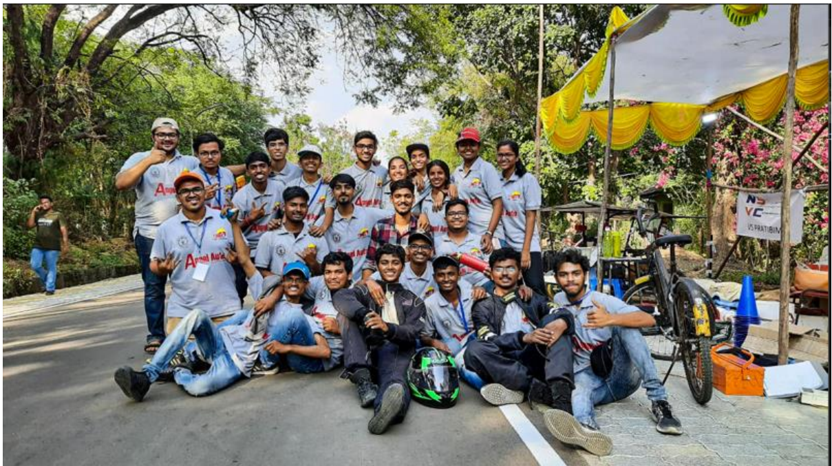
Solethon Winners 2020-21