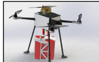
Team Airnova ranked 21 st position in Asia Level during IPAS-2021