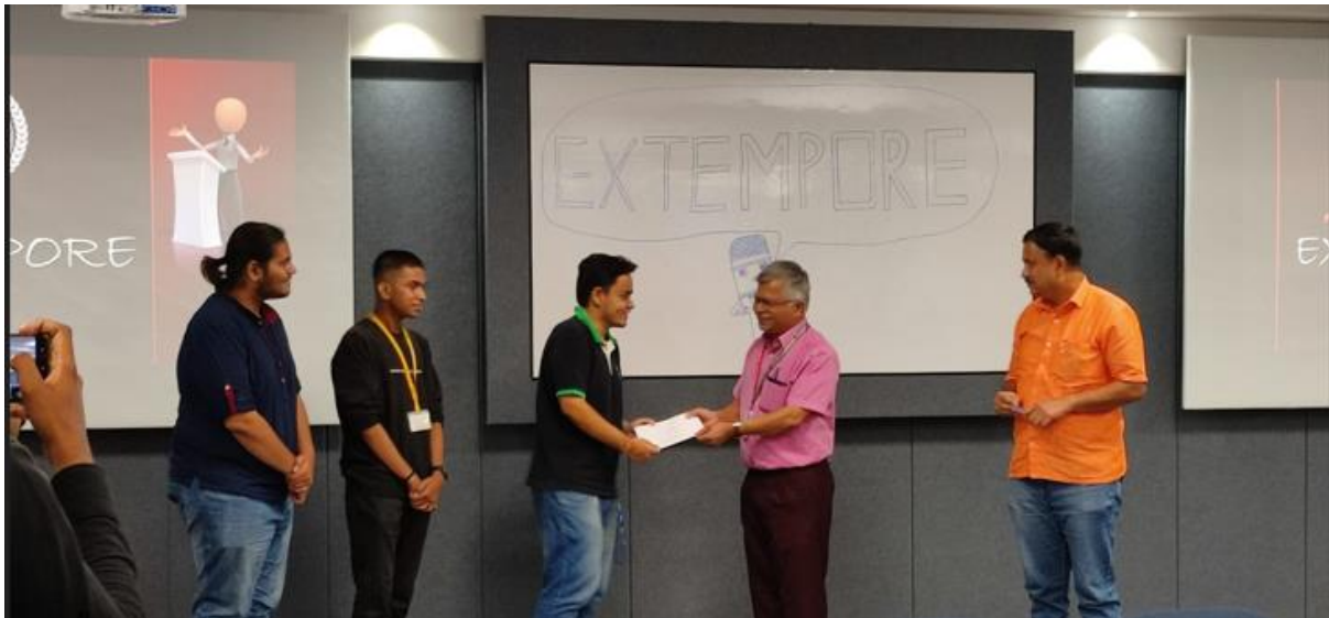
WINNERS OF EXTEMPORE 2023