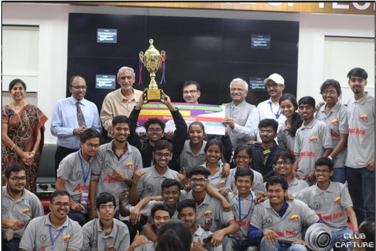
Solethon Winners 20-21