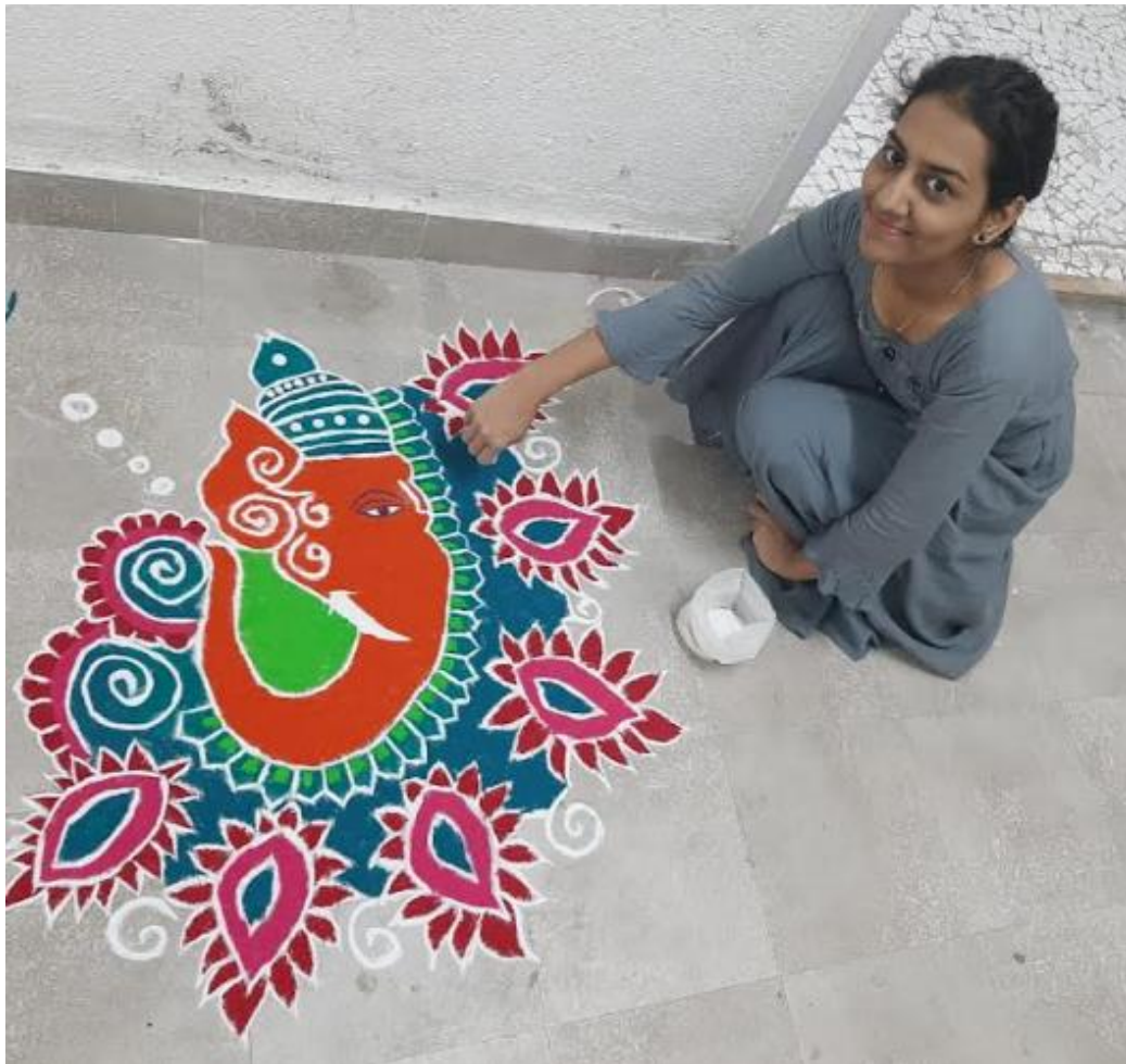
Rangoli Competition NSS Activities 2020-21