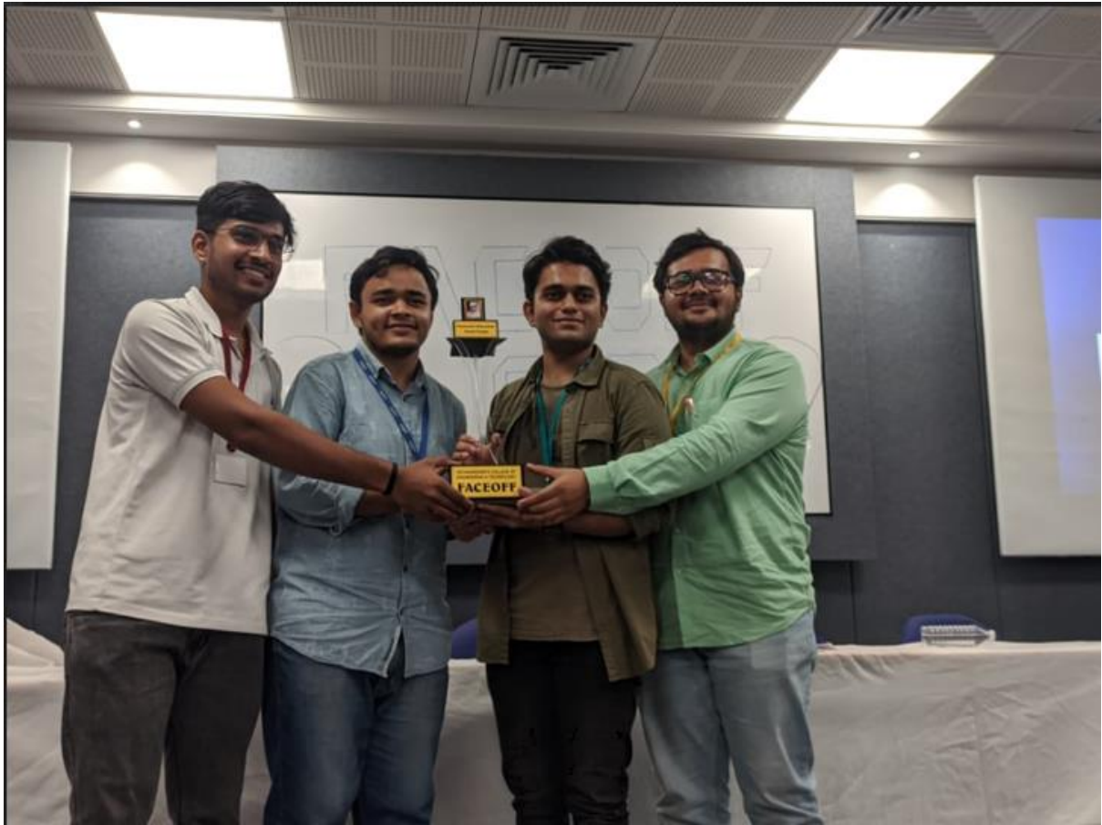
Winners of FACEOFF-2023