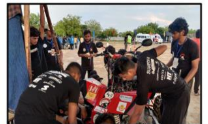
Team Centurions participating in 8th Quad Torc (2022) at Madurai, TN