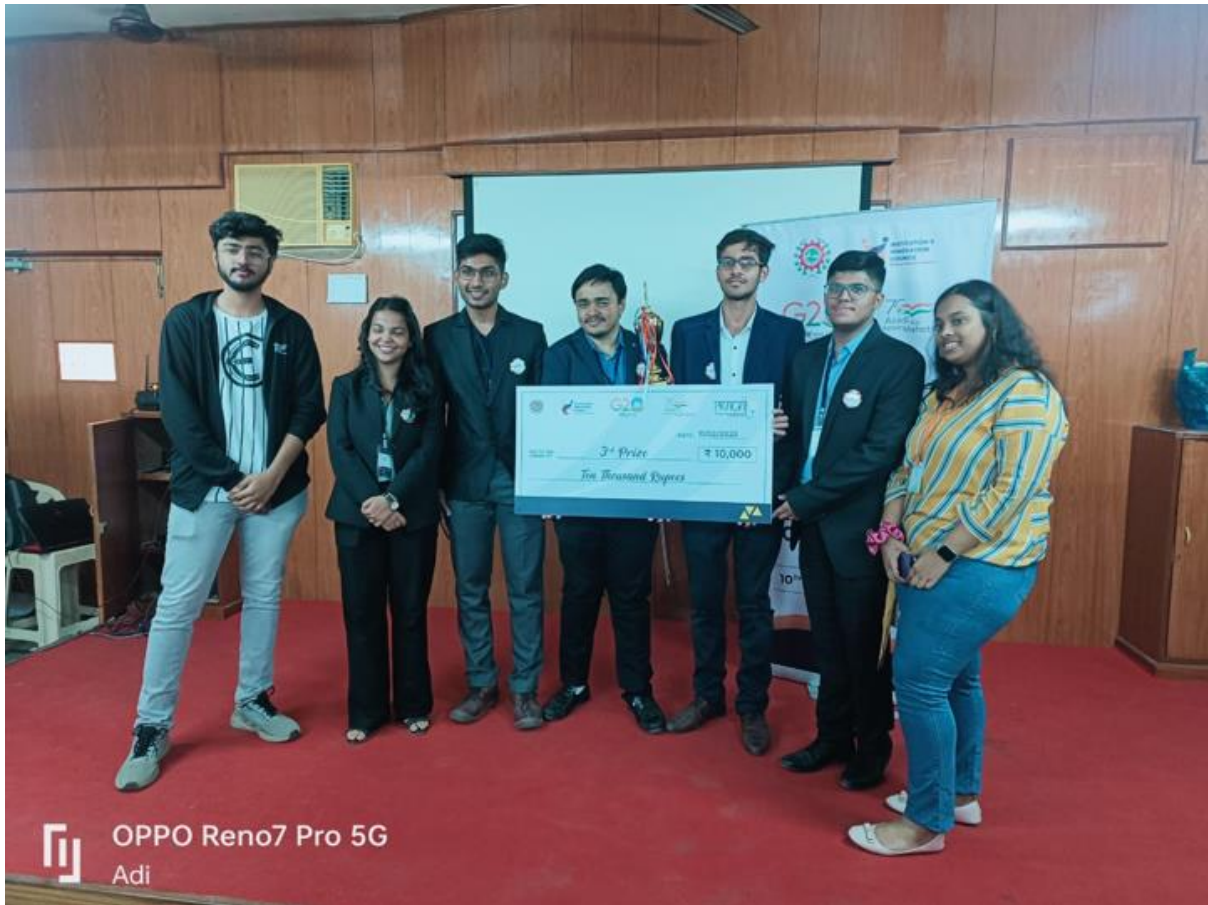
3 RD Pragati 2023 BusinessPlan 2022-23