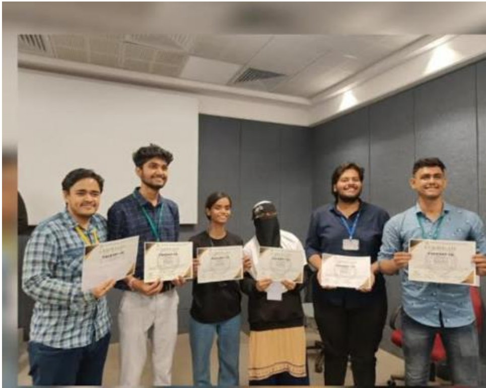
FaceOff Winners and Runner-up 2022-23