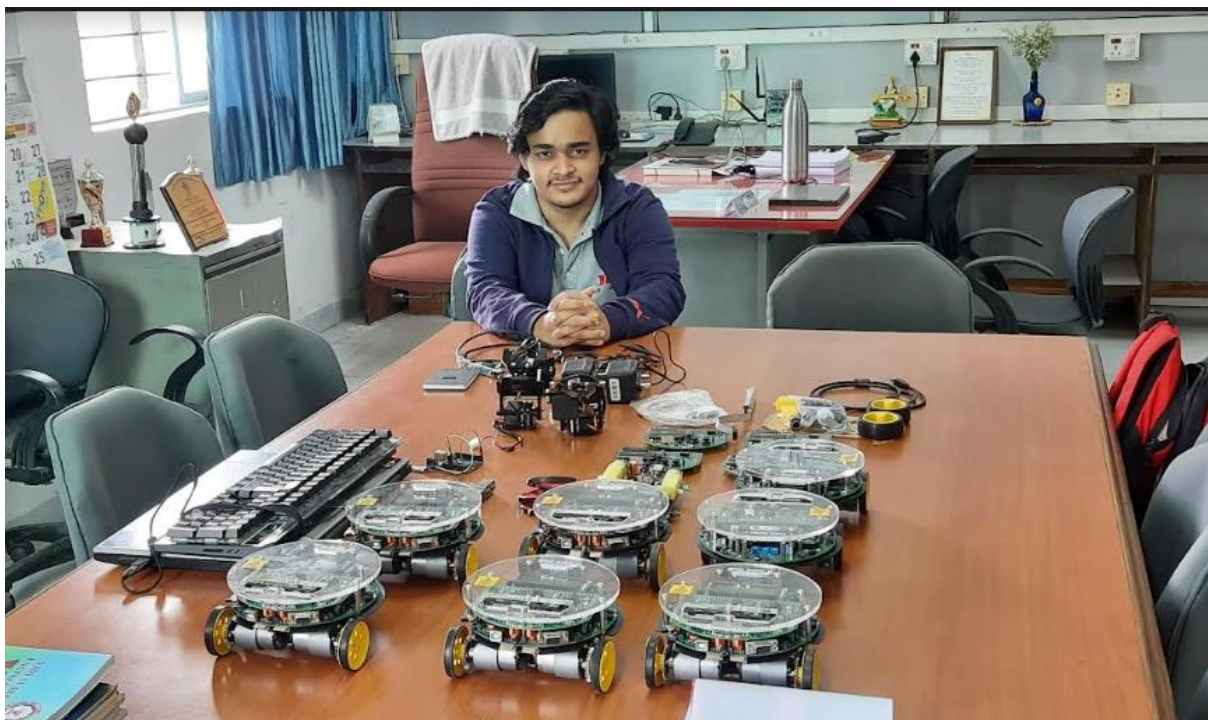
E-yantra Center of Excellence