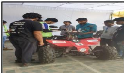
Team Centurions Team Centurions participated in Quad Torc, Season 9 (2023)