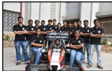
Team ETHAN Racing ranked 8 th at Formula Imperial 2020