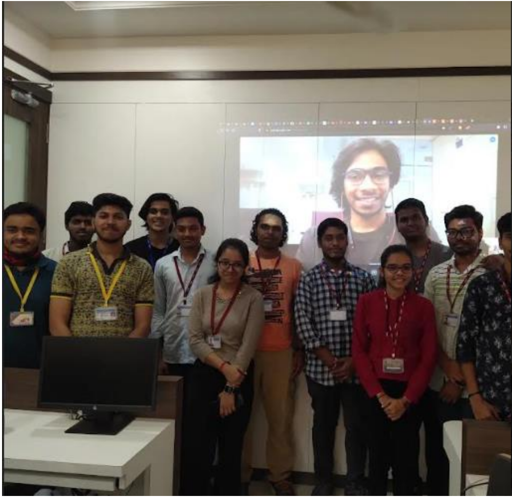
E-yantra Center of Excellence