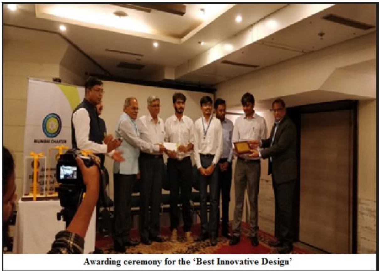
Awarding ceremony for the 'Best Innovative Design'