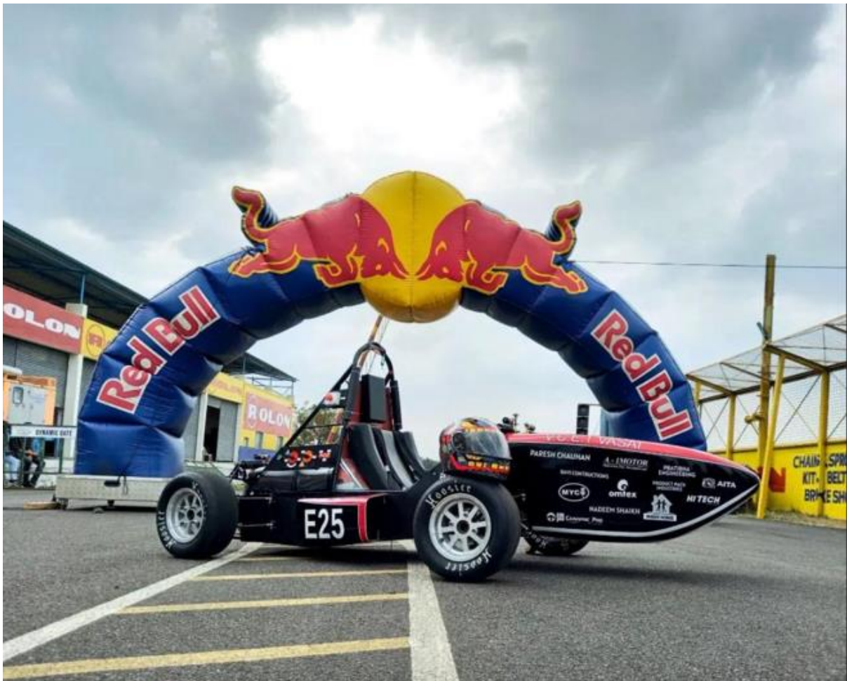
Ethan Racing 2023