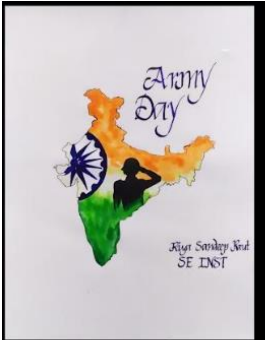
Army Day posters