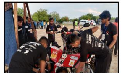
Team Centurions participating in 8th Quad Torc (2022) at Madurai, TN