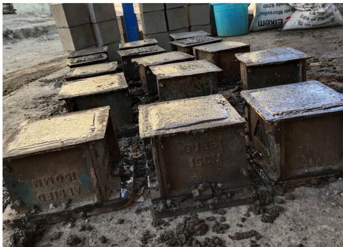
FIG-1: CASTING OF CUBES

The cubes are demolded after 1 day of casting and then kept in respective water for curing at room temperature the cubes are taken out from curing after 7, 14, & 28 days for testing. The demolished concrete has been collected from an authorized and recognized local lab in Maharashtra. (M.S.shetty, 1982)