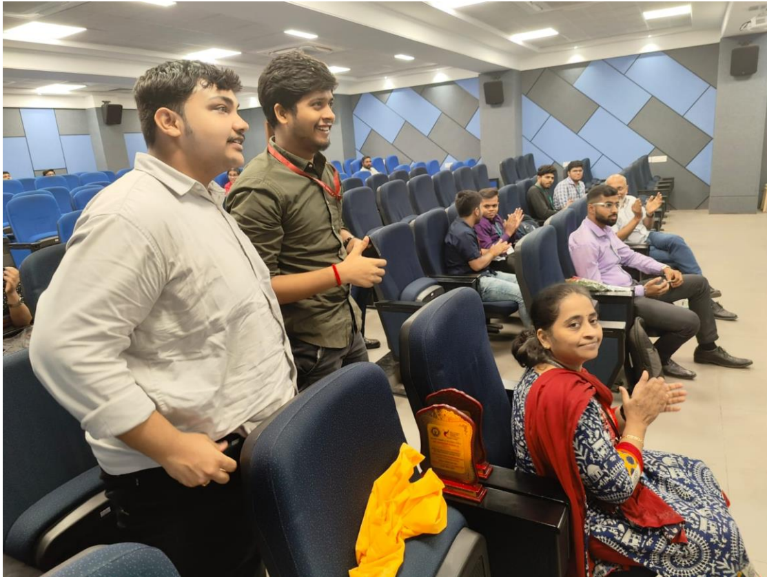
Participant Interaction with the judges during the inter institute Business Plan Competition