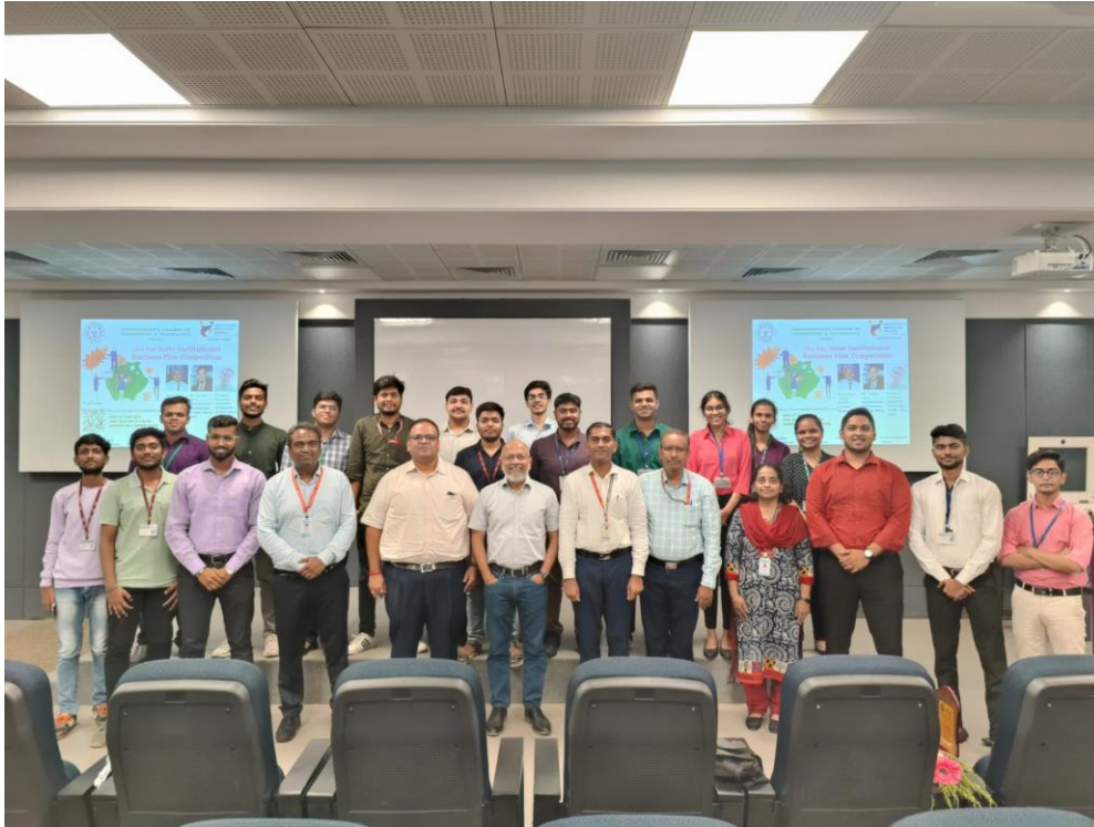
One Day Event on Inter Institute Business Plan Competition